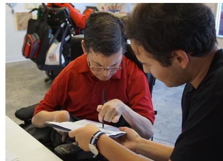
Members of the UCPLA interacted with the proposed Vote By Mail ballot design