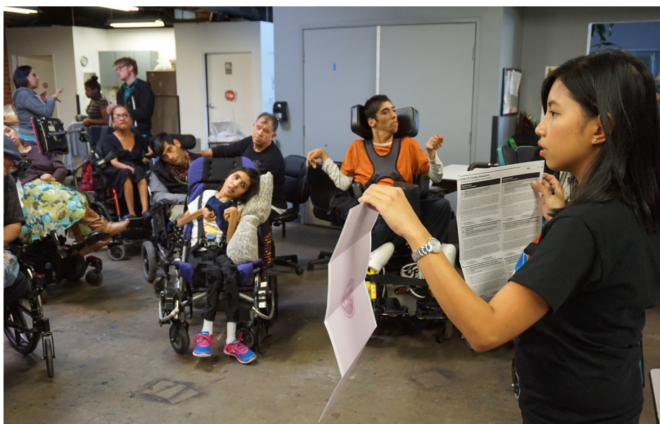
Focus Group Discussion with the members of UCPLA

The Department and IDEO are currently evaluating and analyzing the data gathered from the phone interviews. The data will be used to refine the proposed Vote By Mail design to accommodate the ideas and suggestions from the user testing.