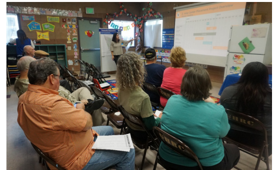
Petit Park, Granada Hills Recreation Center November 17, 2018