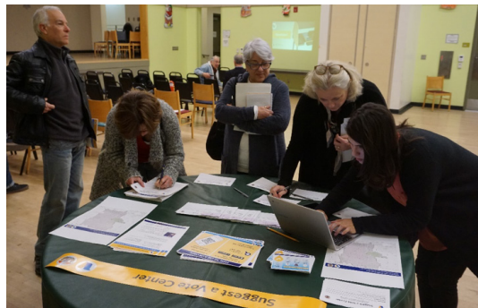
Sherman Oaks East Valley Adult Center December 3, 2018